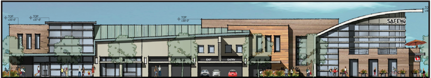
The proposed Safeway renovation at LaPlaya and Fulton Streets (seen here as viewed from LaPlaya Street) currently includes plans for a pharmacy, an outdoor dining terrace, and residences as well as shops on Fulton Street.